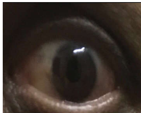
Fig. 2: Pterygium excision with conjunctival autograft with fibrin glue (Six month postoperative picture of same patient)