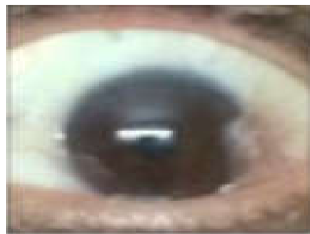
Fig. 1: Primary temporal pterygium